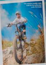
Il nuovo trail center a Montecatini per chi ama il ciclismo